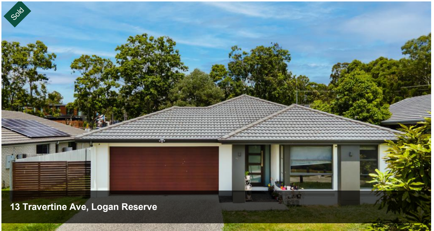
13 Travertine Ave, Logan Reserve