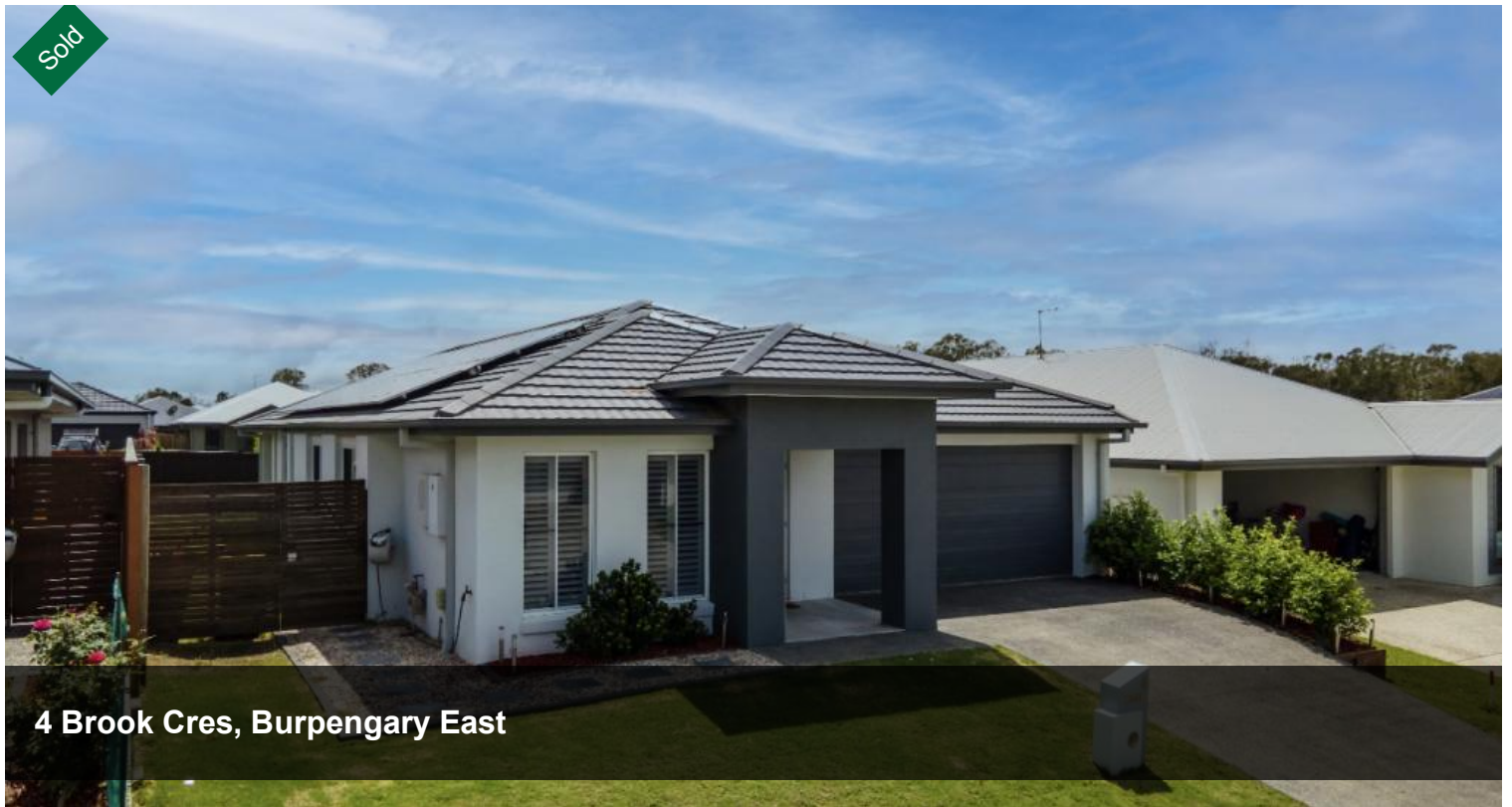
4 Brook Cres, Burpengary East