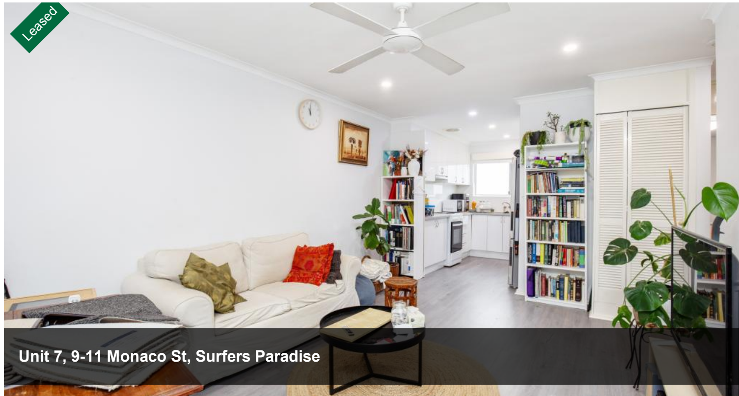
Unit 7, 9-11 Monaco St, Surfers Paradise